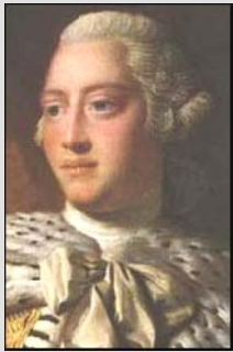
King George III

King George was the British King during the Revolutionary Era (Era means time)