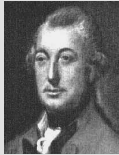
General Charles “Lord” Cornwallis

King George was the British King during the Revolutionary Era (Era means time)